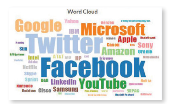
Track dominant companies, people, organizations, products and stock tickers using Themes word clouds