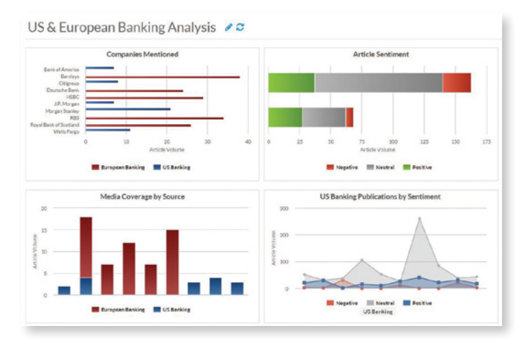
Evaluate media coverage by companies, sentiment, source and more

Advanced analytics enhance your ability to share timely, insightful information and make confident, business decisions related to reputation management, crisis management, competitive intelligence and strategic planning.